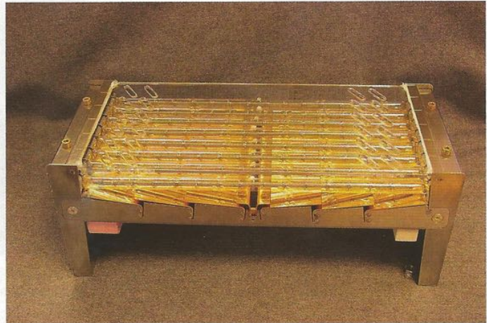
Fig. 1: Compact Engineering's IRE Impact Replacement Emitter with perforated protective glass, gold reflectors and special high efficiency lamps