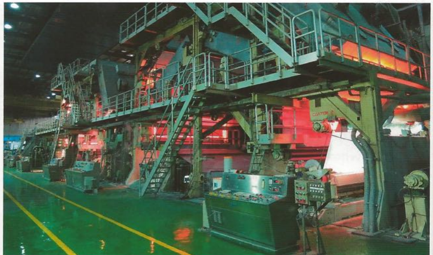
Fig. 2: Compact Engineering's IRE at the 1st and 2nd coater head in the foreground, Impact's emitter on the top coating in the background

The visual difference can clearly be seen in Fig. 2, which shows the coating section of PM3. It is obvious that Compact Engineering's emitters waste less energy in the visible spectrum of light, having a significant higher ratio of invisible infrared light. (Fig. 1)